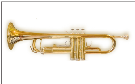
Instrument family: Brass

BASS DRUMS SAXOPHONE TROMBONE TRUMPET PIANO