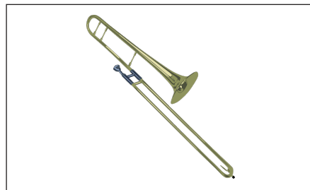
Instrument family: Brass