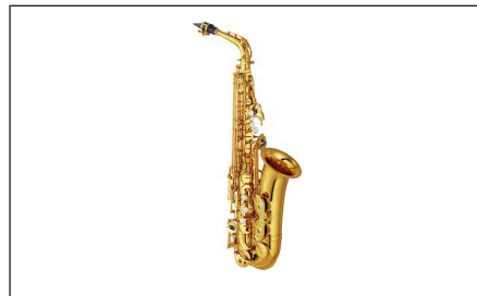
Instrument family: Woodwind