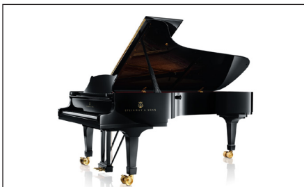
Instrument family: Percussion