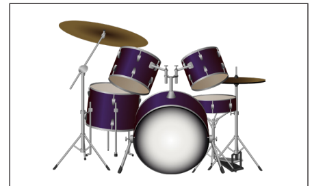
Instrument family: Percussion